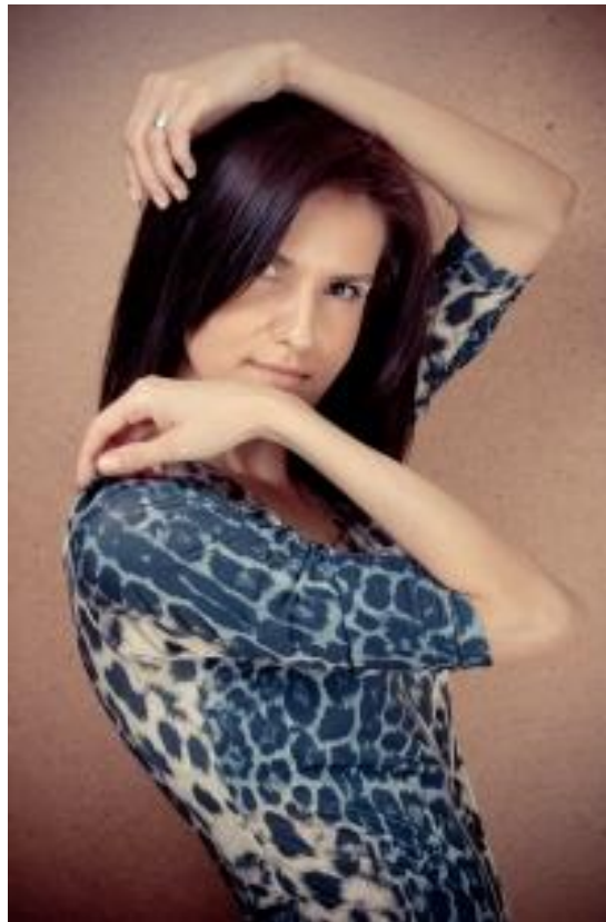
Image is almost always a dominant factor in confidence, therefore having a good image in the form of a healthy and attractive body, will automatically boost the self-confidence levels of the individual. The connection between the way in which the individual perceives his or her body conditions definitely plays an important role in the confidence exuded.